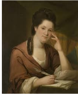
HANNAH MORE – MOST INFLUENTIAL FEMALE PHILANTHROPISTS OF THE AGE OF REVOLUTION

Hannah More (1745-1833) was a poet, playwright, philanthropist and anti-slavery campaigner who helped abolish the slave trade.