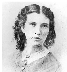
ELIZABETH BLACKWELL – FIRST WOMEN TO GET A MEDICAL DEGREE

Elizabeth Blackwell (1821-1910) was the first woman to be awarded a medical degree and be accepted onto the medical register of the General Medical Council.